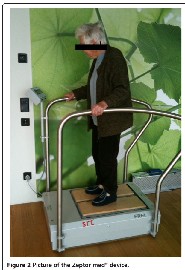
Figure 2 Picture of the Zeptor med ® device.

The criteria for success [19] of this pilot study were based on feasibility and focused on recruitment, attrition and adherence to the stochastic resonance WBV intervention.